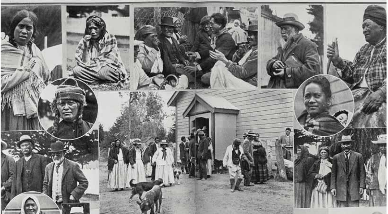
Snapshots of Māori attending a sitting of the Māori Land Court - Lake Taupō, 1914

Traditionally whakapapa was entrusted orally to a member of the whānau selected to be its caretaker.